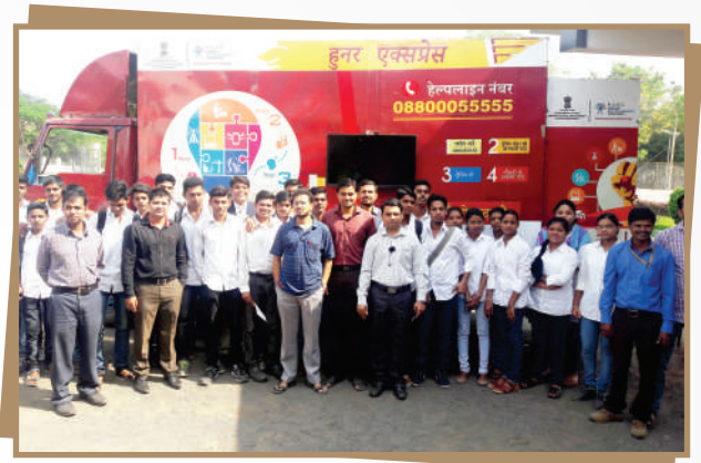
Hunar Express - an Activity of Central Govt. at DDU Kaushal Kendra, CFC Auditorium on 10 Aug. 2015