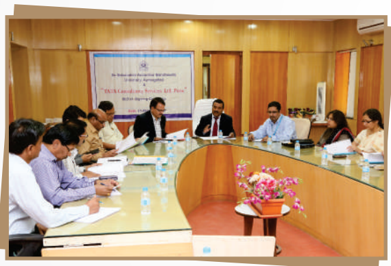
Meeting with TCS Authorities regarding MOU of "English Communication and Corporate Etiquettes"