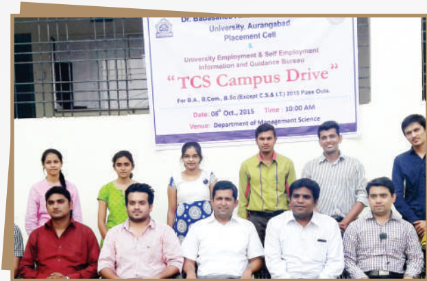
Selected Students in TCS Campus Interview 9th Jun. 2015