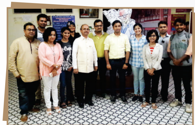
Campus Drive by MY FM Radio Channel at Journalism Department on 6th Oct. 2016