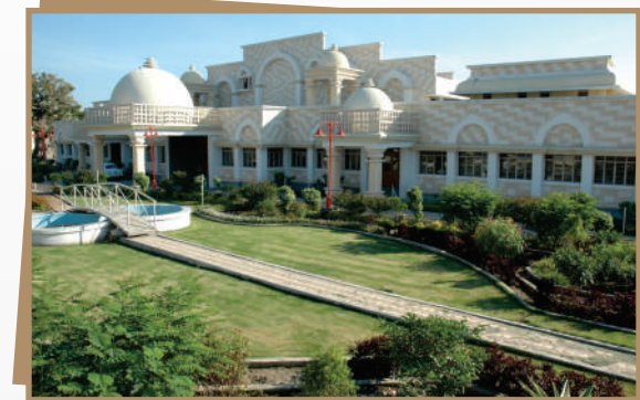
Central Auditorium of University