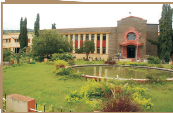
Knowledge Resource Center Central Library of University