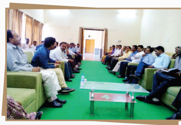
Training & Placement Officer Meet at Auditorium University on 26 Feb. 2015