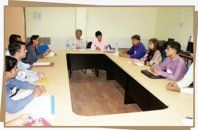
Group Discussion Session at the time of Campus Drive for TCS 9 Jun. 2015