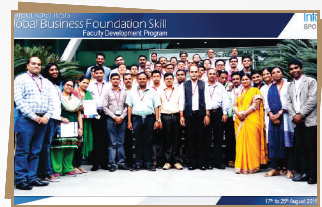
Infosys Train The Trainer Batch 2015 29th Jun. to 7th Jul. 2015