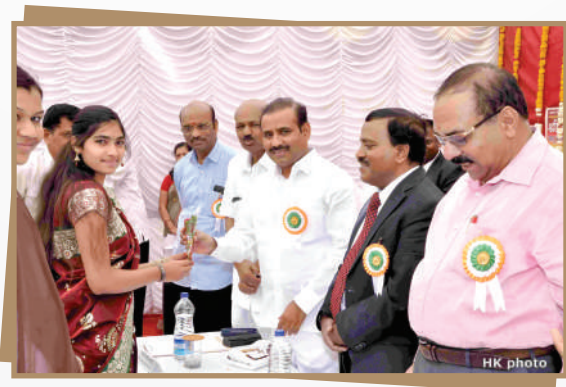
Hon. Vice-Chancellor Felicitating Students got placed through NUSSD