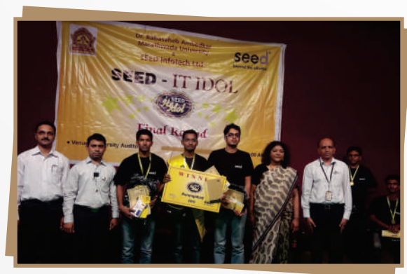
Seed IT Idol Competition winners of 2015 at Central Auditorium of University

The scheme of establishing Career & Counseling Cell in Universities has been launched to address the diverse socio economic handicaps and geographic backgrounds of the heterogeneous populations of students coming to the Universities vis-a-vis equity of access and placement opportunities through availability of appropriate institutional support information. Linguistic differences and cultural gaps among students also call for the setting up of such a dispensation for suitable guidance and support in this age of globalization and competitive placements. Availability of relevant and accessible information coupled with professional guidance to utilize the same can result into better career achievements outside the classrooms and help in their healthy progression of our students.