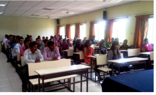
Students Gathered for attending Interviews