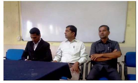
Company Presentation before Interview starts