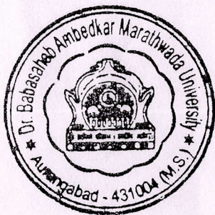
Dr. Babasaheb Ambedkar Vice Chancellor, Dr Babasaheb Ambedkar Marathwada University Aurangabad (MS) India