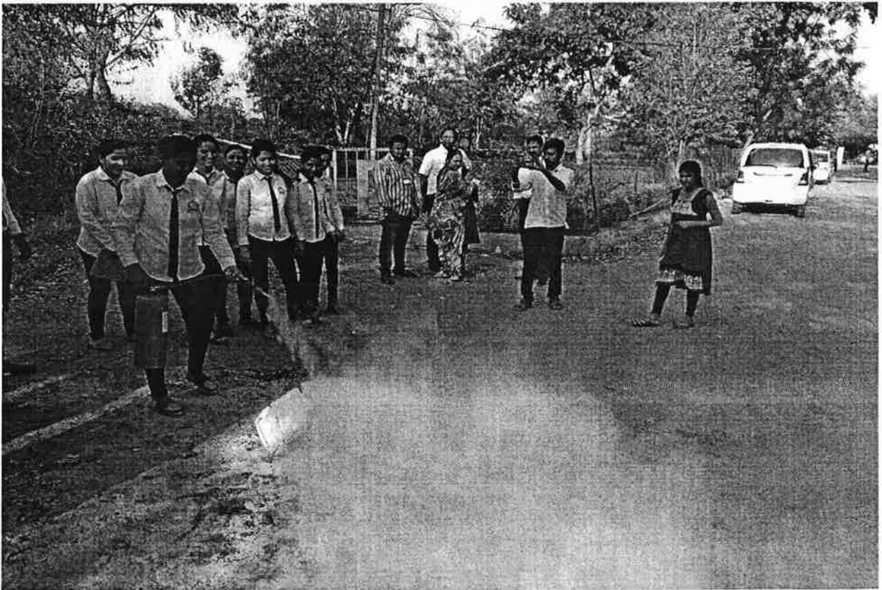
Practical Demonstration of Fire Fighting in front of the Department of Environmental Science, Dr. BAMU Aurangabad