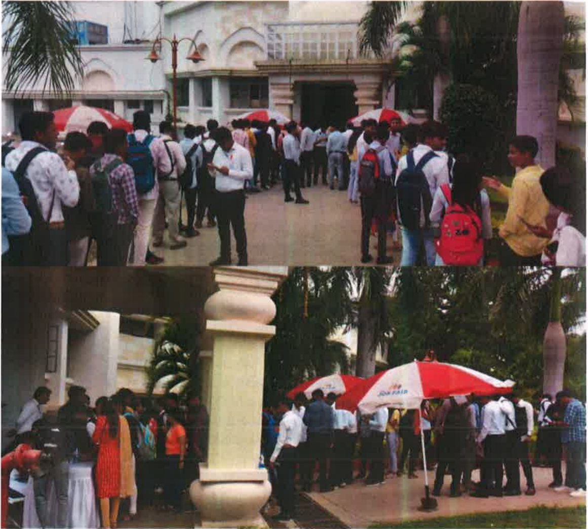
Attendance by a large number of students marked the success of Job fair organised by Training and Placement Cell Dr. Babasaheb Ambedkar Marathwad University, Aurangabad (MS)

The event schedule included an opening ceremony featuring speeches from university officials and representatives from participating companies. Companies set up booths where students could interact with recruiters, submit resumes, and learn about job openings. On-the-spot interviews were conducted by some companies to expedite the selection process and provide instant feedback to candidates. Networking sessions were dedicated time slots allocated for students to network with company representatives and gain insights into various industries and job roles. The event concluded with a closing ceremony where the outcomes were summarized, and shortlisted candidates were announced. The event saw enthusiastic participation from both students and companies, creating a dynamic and productive atmosphere. Students expressed appreciation for the opportunity to interact with multiple employers and secure job interviews on the spot. Companies praised the quality of the candidates and the efficient organization of the event, expressing interest in future collaborations with the university. The feedback from participants and stakeholders