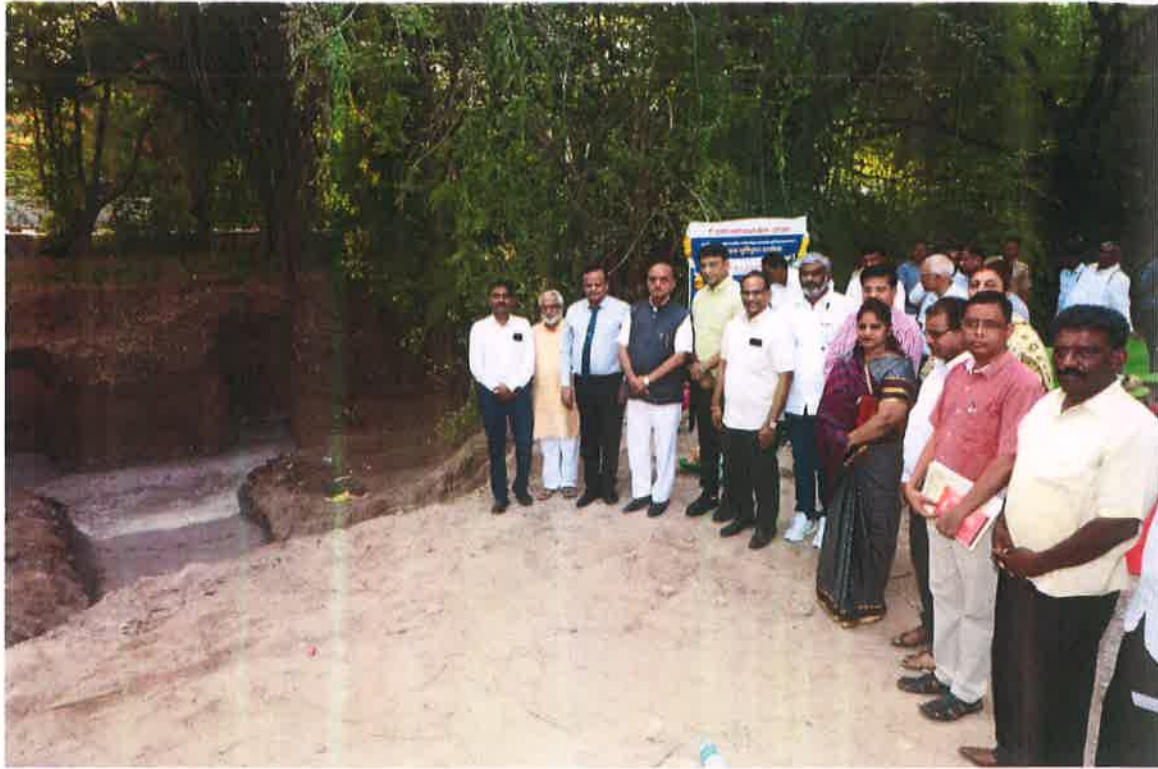
Glimpses from the Event. Dignitaries enlightened the participants and water activists in very simple manner. Encouragements were given to continue with such holy efforts.