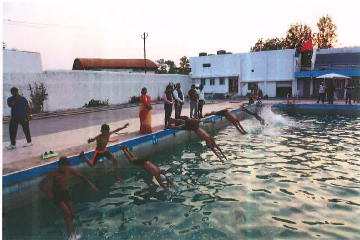
Hon'ble Vice Chancellor, Hon'ble Pro Vice Chancellor, Registrar and Deans motivating the participants at the event