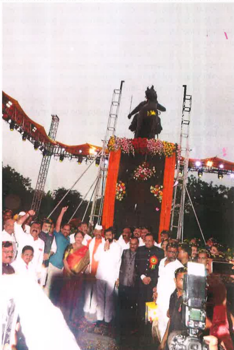
Hon'ble Chief Minister of Maharashtra, along with Hon'ble Vice Chancellor and other honoured dignitaries during the event

Key attendees included the Hon'ble Chief Guest, Special Guests, dignitaries from Dr. Babasaheb Ambedkar Marathwada University, prominent members of the Aurangabad community, university representatives, faculty members and administrative staff, students from various departments, and community members from diverse backgrounds. The event highlighted the importance of Chhatrapati Shivaji Maharaj's contributions to Indian history and culture, his relevance as a symbol of courage, justice, and governance, and the educational and cultural value of having such a statue on campus. Cultural performances, including traditional dances, music, and drama, were carried out by students and local artists, adding a vibrant and festive atmosphere to the occasion. Key Performances included a traditional Maharashtrian dance depicting the bravery and valor of Chhatrapati Shivaji Maharaj's warriors, a musical tribute featuring songs and instruments that reflected the cultural heritage of Maharashtra, and a theatrical skit highlighting key moments from the