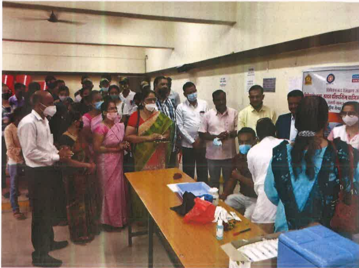
Glimpses of Covid-19 Vaccination Drive Project . Enthusiastic participation of local residents could be recorded.