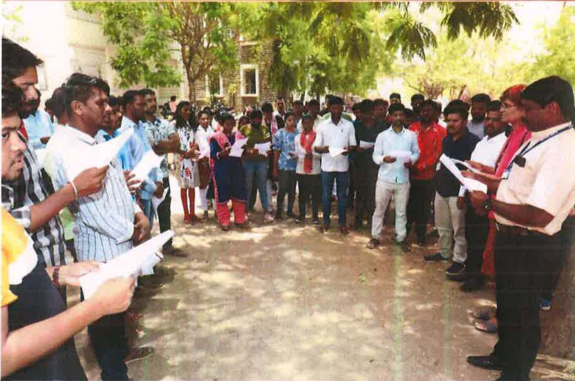
Glimpses from the Pledge Taking Event

The coordinator outlined the objectives of the program, which aimed to raise awareness about the importance of cleanliness and to motivate participants to actively contribute to the cleanliness of their surroundings. Following the address, participants collectively took