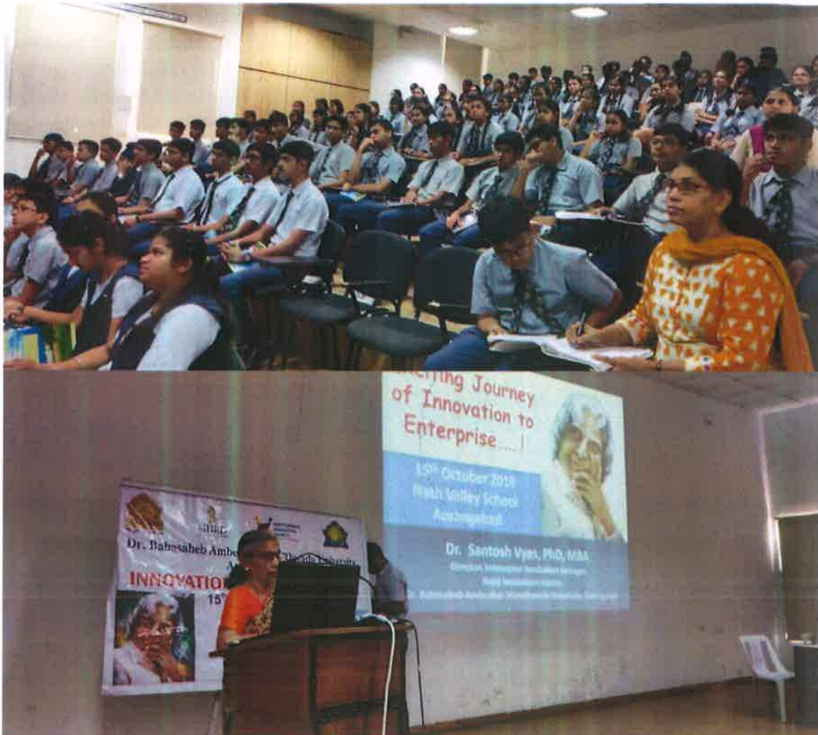
Glimpses of Innovation day celebration at Dr. Babasaheb Ambedkar Marathwada University Aurangabad (MS), through on – campus and off-campus activities at Nath valley School, Aurangabad (MS)

The event saw enthusiastic participation from faculty members, and students from Nath Valley School. The engagement highlights included enjoyable insight to practise of critical thinking towards innovation and development requisites of an innovation ecosystem at school academics and its importance, which was well-received, and the interactive Q&A session at Nath Valley School, which was particularly engaging. Feedback from participants highlighted the success of the event in promoting innovation and fostering an entrepreneurial mindset. University officials appreciated the detailed presentation and thorough discussion on the innovation ecosystem plan, while faculty members valued the opportunity to contribute ideas and suggestions towards the university's innovation strategy. Students expressed excitement about the concept of innovation and the interactive nature of the expert talk. Community impact was enhanced awareness about the importance of innovation among university students and school students, strengthened collaboration, and encouraged creativity. Key outcomes of Innovation Day include the