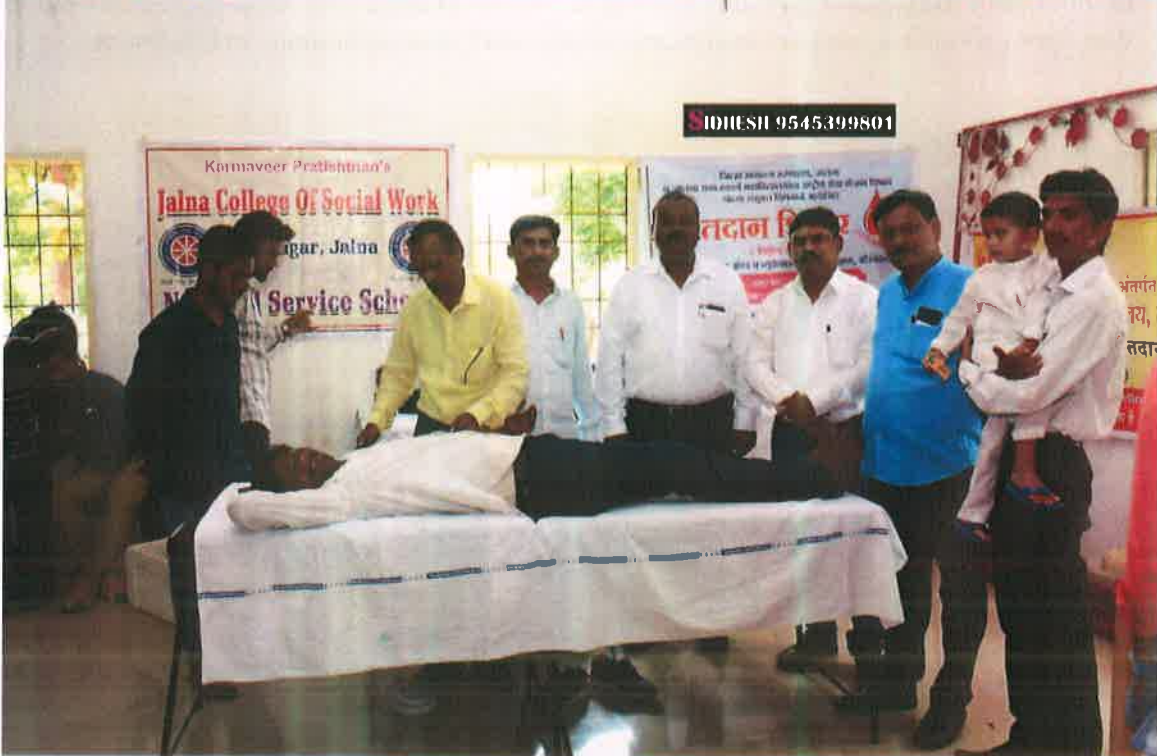
Moments from the workshop. Unparallel enthusiasm among participants could be observed.

The NSS unit, in conjunction with the collaborating colleges, meticulously planned the event to ensure smooth execution and maximum participation. Coordination with healthcare providers and local authorities was crucial for the camp's success. Preparatory steps included partnering with local blood banks and hospitals for the collection and safe handling of blood donations. Volunteer mobilization was also conducted through posters, social media, and local media to inform and invite citizens to participate. The event was by