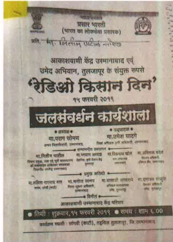
Glimpses of Radio Kisan Day Event