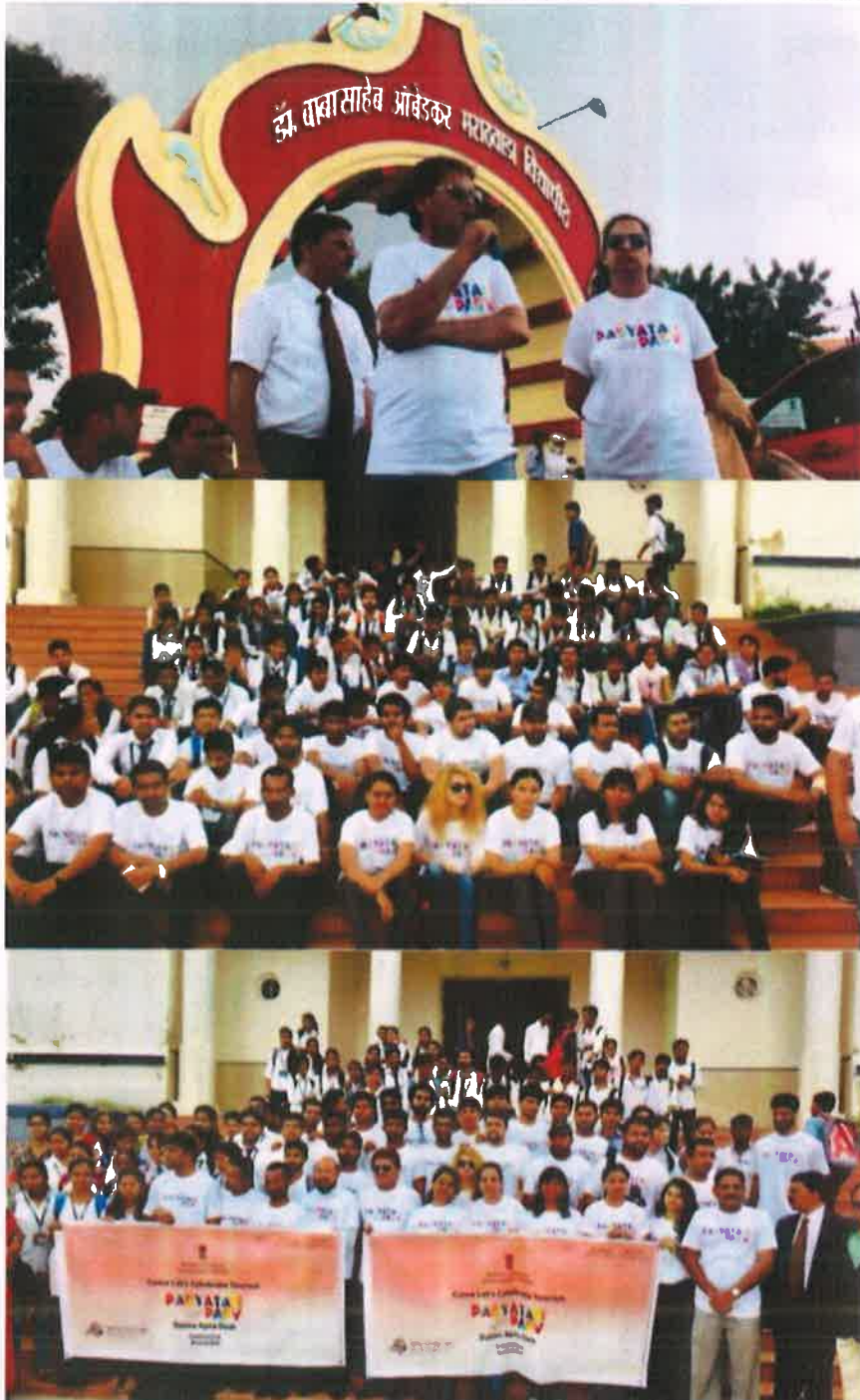
Glimpses from Variuos Activities under Paryatan Parv Initiative by Department of Tourism Administration, Dr. Babasaheb Ambedkar Marathwada University Aurangabad (MS)

The objectives of the event were to promote tourism awareness, highlight regional heritage, engage the community, and encourage sustainable and responsible tourism practices among participants and stakeholders. The university formed a dedicated event coordination committee to plan and oversee all activities related to Paryatan Parv, working closely with the Ministry of Tourism to align the event with national objectives and