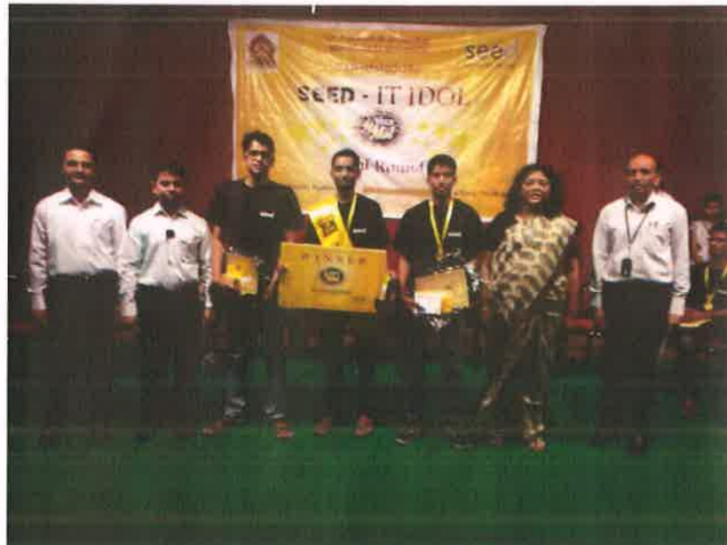
A view after Prize Distribution Ceremony of SEED IT IDOL Event

The SEED IT Idol competition was an initiative by Dr. Babasaheb Ambedkar Marathwada University, Aurangabad, aimed at identifying and celebrating the best Information Technology talent among students. The competition brought together participants from various computer science and related departments within the university and its affiliated colleges. It served as a platform for students to showcase their technical skills, creativity, and innovative thinking in the realm of Information Technology. The primary objective of the competition was to identify the best IT brains, encourage innovation and creativity, provide exposure, and enhance career opportunities by highlighting the talents of participants to potential employers and industry professionals.