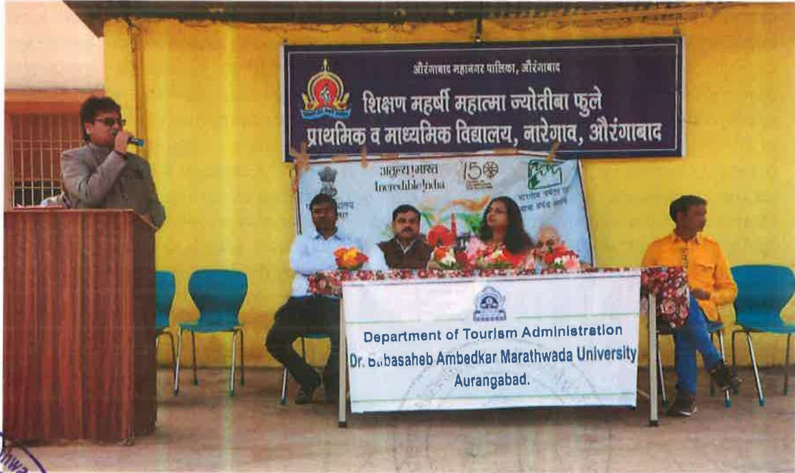
Glimpses of Swachh Bharat Swachh Paryatan drive inauguration event at Naregaon area of Aurangabad. Enthusiastic participation of local residents could be recorded.

The Swachh Bharat Swachh Paryatan campaign, organized by Swachh Bharat Swachh Paryatan Forum in collaboration with the Department of Tourism Administration, Dr. Babasaheb Ambedkar Marathwada University, Aurangabad, aimed to promote cleanliness and hygiene in the surrounding areas. The event involved 55 students from Dr. Babasaheb Ambedkar Marathwada University, faculty members and 150+ students from Mahatma Jyotiba Phule School, Naregaon, and local residents of Naregaon.