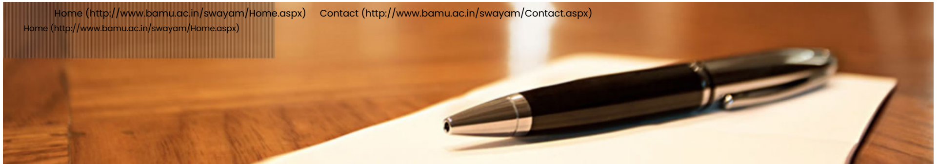
Dr. Babasaheb Ambedkar Marathwada University – Swayam