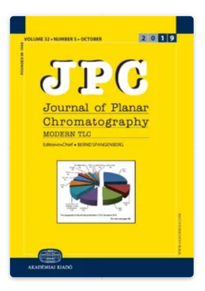
JPC - Journal of Planar Chromatography - Modern TLC

Print ISSN: 0933-4173 Online ISSN: 1789-0993