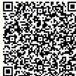
Managing Director NASCENCY INFOTECH AURANGABAD